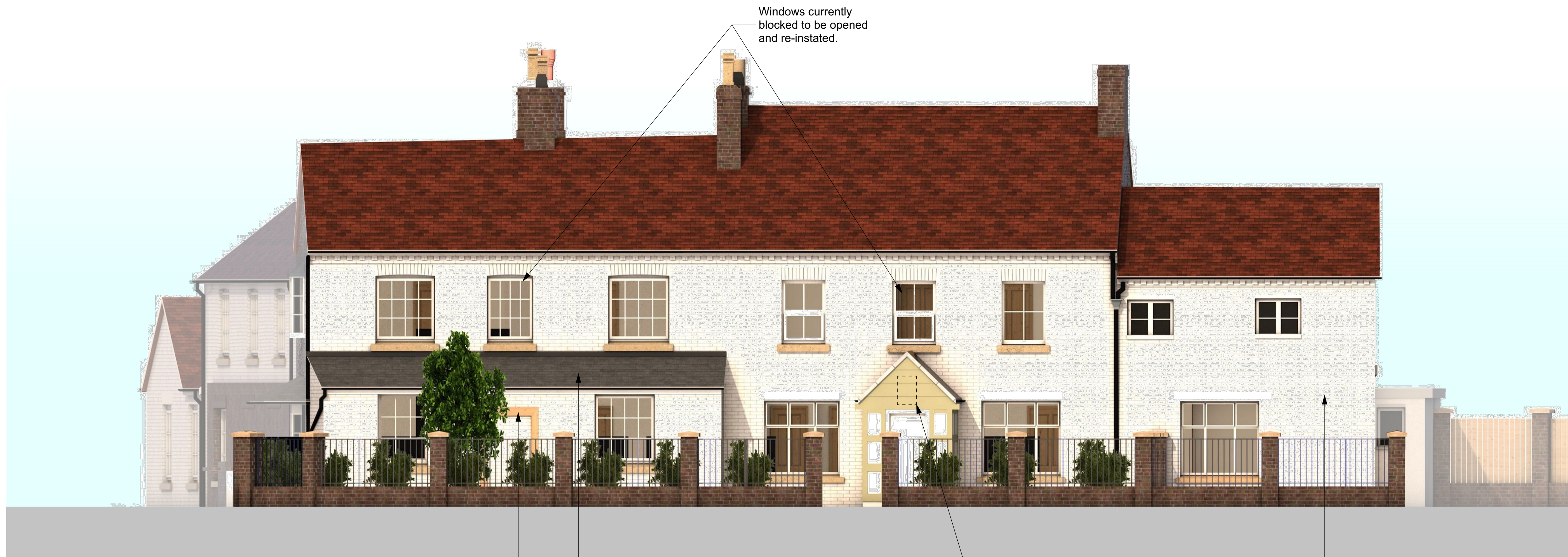
East Elevation (street view)